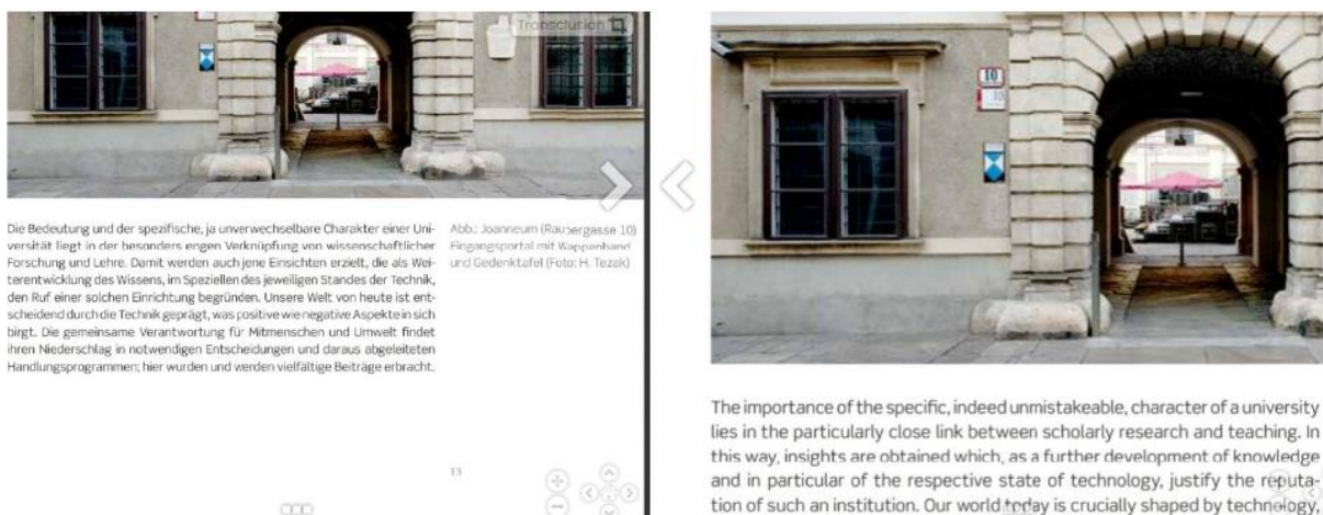
Fig.2: The same page taken from two books in different languages shown simultaneously.